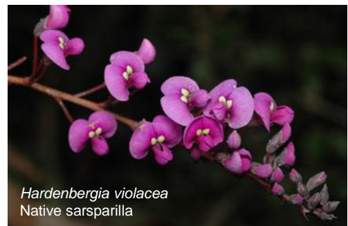
Hardenbergia violacea Native sarsparilla

This path continues to the lookout platform which marks the end of the Bushland Nature Walk. Look for interpretive signs which act as a guide to the local vegetation. Please stay on the path.