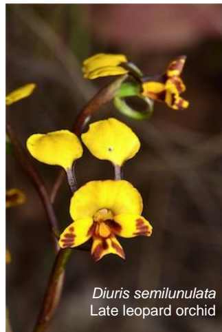
Diuris semilunulata Late leopard orchid

Go through the gate, please close the gate behind you . This gate is locked at 5:00 pm daily.