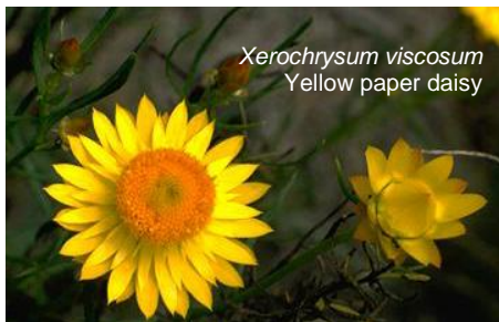
Xerochrysum viscosum Yellow paper daisy

As you leave the Visitor Centre turn left, take notice of the directional signs (see image) as they mark the way. Turn left at end of building and go down the steps, following the signs. Cross the pedestrian crossing into the Grassy Woodland Garden.